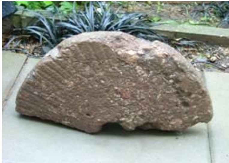
Quern Stone fragment May 2014 (Page 4)